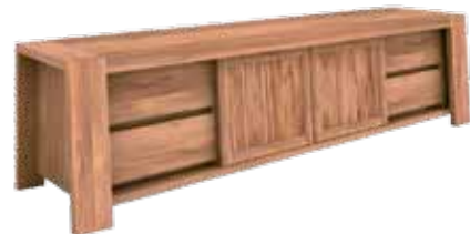
Low Dresser 2 Sliding Doors 4 Drawers Behind the doors 2 open racks TR 830175 → 200 ↗ 44/50 ↑ 52 TR 830176 → 220 ↗ 44/50 ↑ 52 TR 830177 → 240 ↗ 44/50 ↑ 52