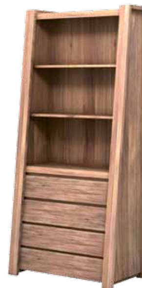
Bookcase Double 4 Drawers 3 Racks TR 820013 → 90 ↗ 30/55 ↑ 220