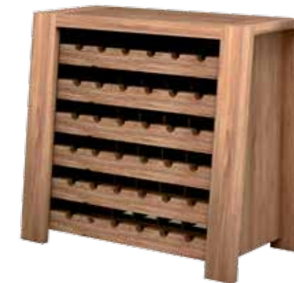
Winerack 36 Racks for Winebottles TR 800112 → 100 ↗ 40/50 ↑ 90