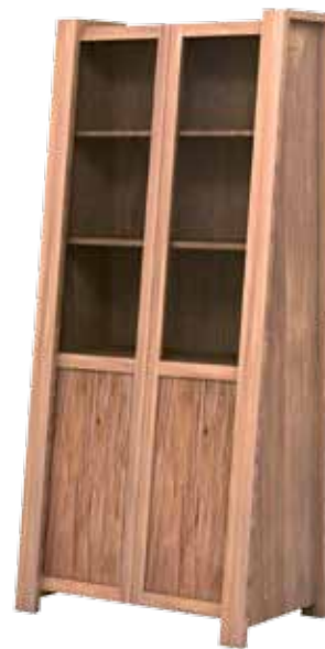
Showcase Double 2 Sliding Doors Half Glass / Half Panel TR 820022 → 90 ↗ 30/55 ↑ 220

"There is nothing like staying at home for real comfort." (Jane Austin, British writer, 1775-1817)