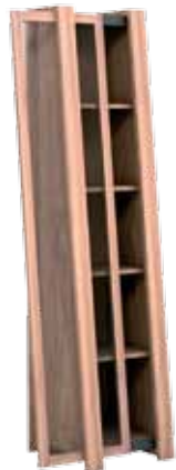
Bookcase Single 1 Glass Sliding Door Left TR 820017 → 54 ↗ 30/55 ↑ 220