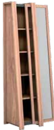
Bookcase Single 1 Glass Sliding Door Right TR 820018 → 54 ↗ 30/55 ↑ 220