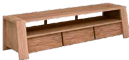
Low Dresser 3 Drawers 1 Open Rack TR 830142 → 180 ↗ 45/50 ↑ 45 TR 830144 → 220 ↗ 45/50 ↑ 45 TR 830146 → 240 ↗ 45/50 ↑ 45