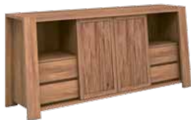
High Dresser 2 Sliding Doors 4 Drawers 2 Racks TR 830169 → 200 ↗ 40/50 ↑ 90