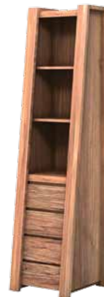
Bookcase Single 4 Drawers 3 Racks TR 820012 → 54 ↗ 30/55 ↑ 220