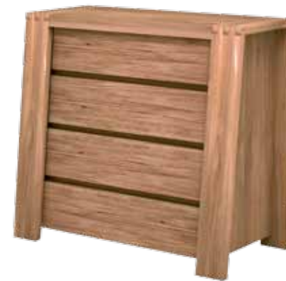
Small Cabinet 4 Drawers TR 800012 → 100 ↗ 40/50 ↑ 90

"He is happiest, be he king or peasant, who finds peace in his home." (Johann von Goethe, German writer, 1749-1832)