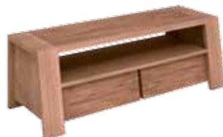
Low Dresser 2 Drawers 1 Open Rack TR 830140 → 130 ↗ 45/50 ↑ 45