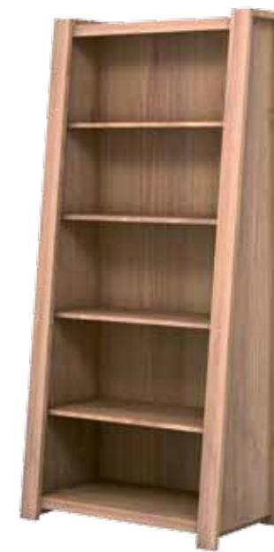
Bookcase Double 5 Racks