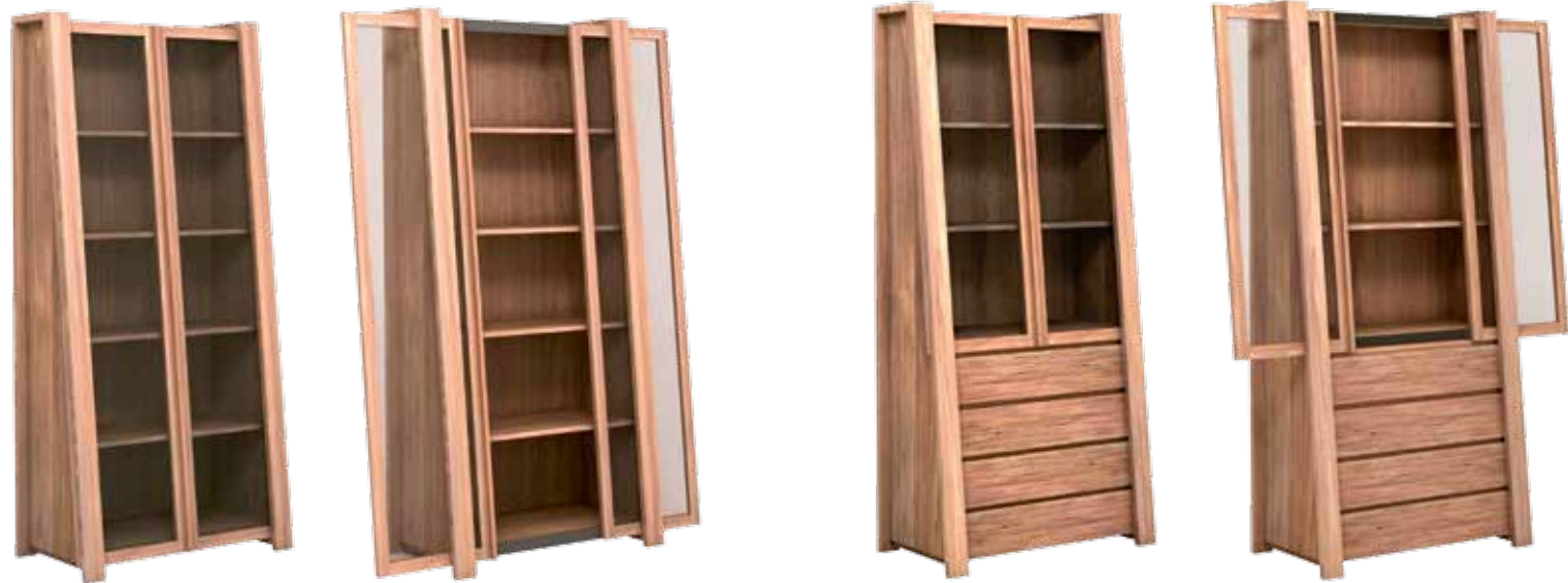
Showcase Double 2 Glass Sliding Doors

From china and glassware to photos and antique vases, the Trapesium model will display your treasures with stylish flair.