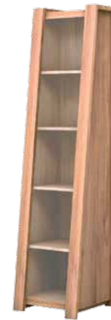
Bookcase Single 5 Racks