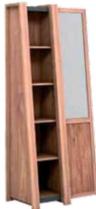
Showcase 1 Sliding Half Glass / Half Panel Door Right TR 820021 → 54 ↗ 30/55 ↑ 220