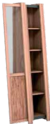
Showcase 1 Sliding Half Glass / Half Panel Door Left TR 820020 → 54 ↗ 30/55 ↑ 220