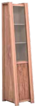
Showcase 1 Sliding Door Half Glass / Half Panel