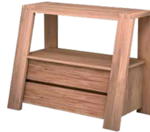
Side Table 2 Drawers 1 Open Rack

To love beauty is to see light . (Victor Hugo, French writer 1802-1885)