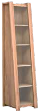
Bookcase Single 1 Glass Sliding Door